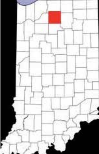
Figure 1. Marshall County is located in Northwest Indiana

Many of Marshall County's population demographics mirror the demographics of Indiana. Overall, Marshall County is slightly older, from the perspective of median age and overall proportion. An above-average percentage of Marshall County's population identifies as Hispanic and there is a much smaller African-American population in comparison to the Indiana average. A majority of the focus group sample statistics for Marshall County mirrors the overall county statistics. There are a few exceptions. The median age of CHNA participants was well above the county average, as there was a much smaller representation among young participants in Marshall County, which may also be the result of excluding the "Under 18" population.